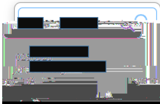
Name and ID blacked out in screen shot.

Select a status (approved or denied) for the permission, select a reason and provide any additional comments, if desired. Click the SAVE button to issue the waiver. You can also DENY a requested permission.